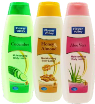
Calming Cucumber Rich Honey & Almond Antioxidant Aloe

Flower Valley Moisturizing Body Lotion Feel Your Skin Flourish